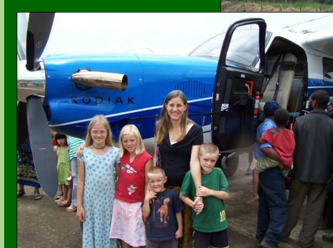
Above: the Kodiak taxis to the hangar after its first landing at the Aiyura airstrip near Ukarumpa